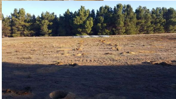
Plant physiology and growth trials