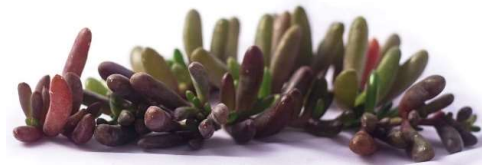
Karkalla (baby pigface)