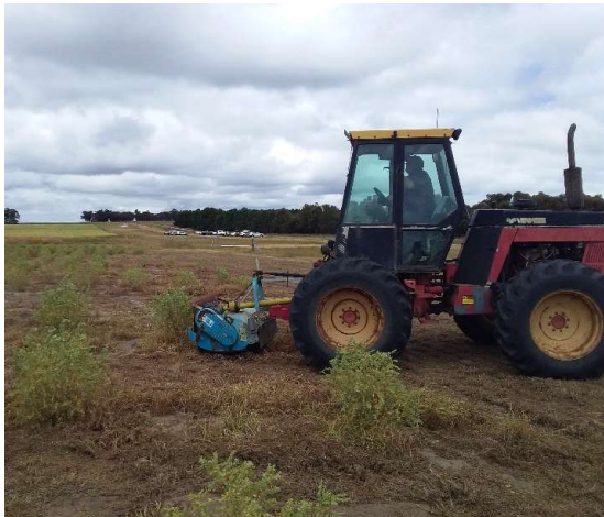
2 new machines – Former & Harvester