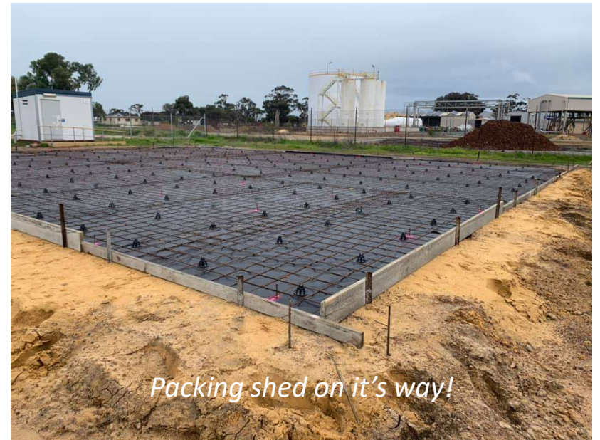
Packing shed on it's way!