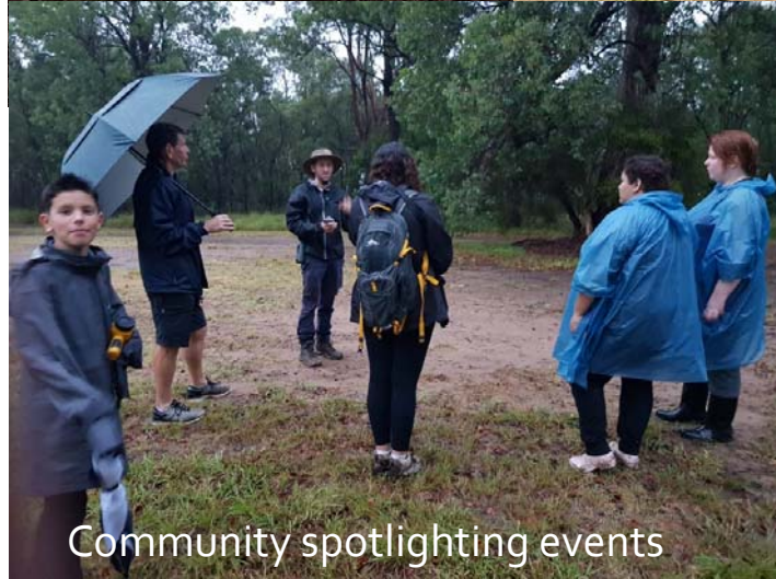
Community spotlighting events