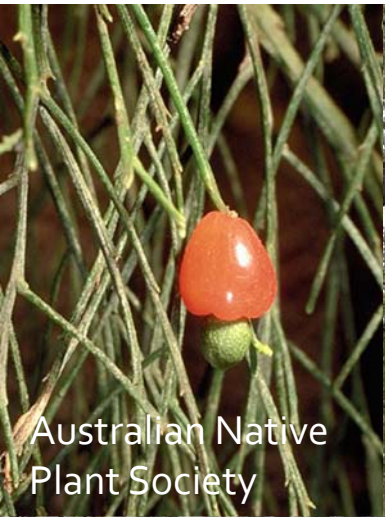
Australian Native Plant Society