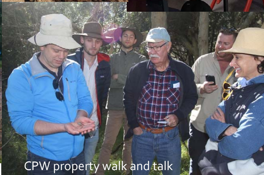
CPW property walk and talk