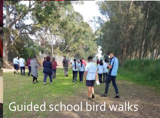
Guided school bird walks