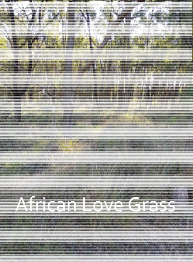
African Love Grass