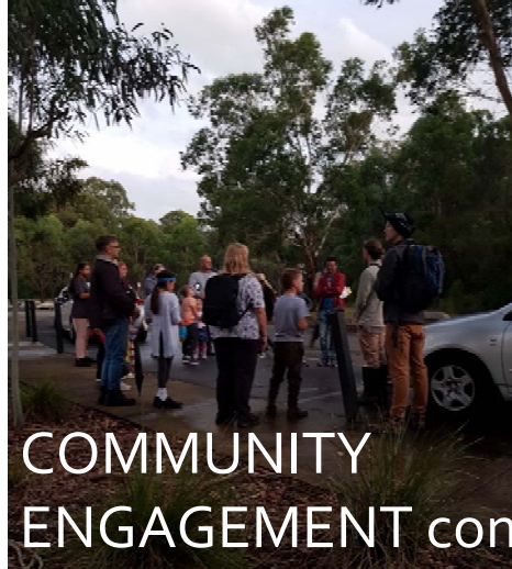
COMMUNITY ENGAGEMENT cont.