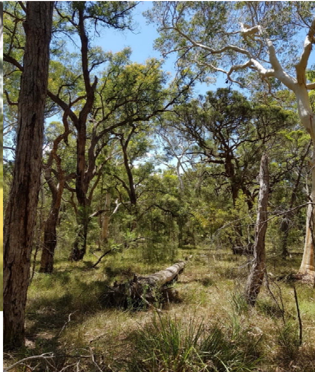
Castlereagh Scribbly Gum Woodland