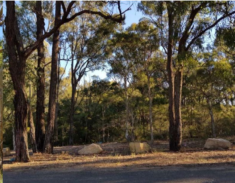
Cooks River Castlereagh Ironbark Forest