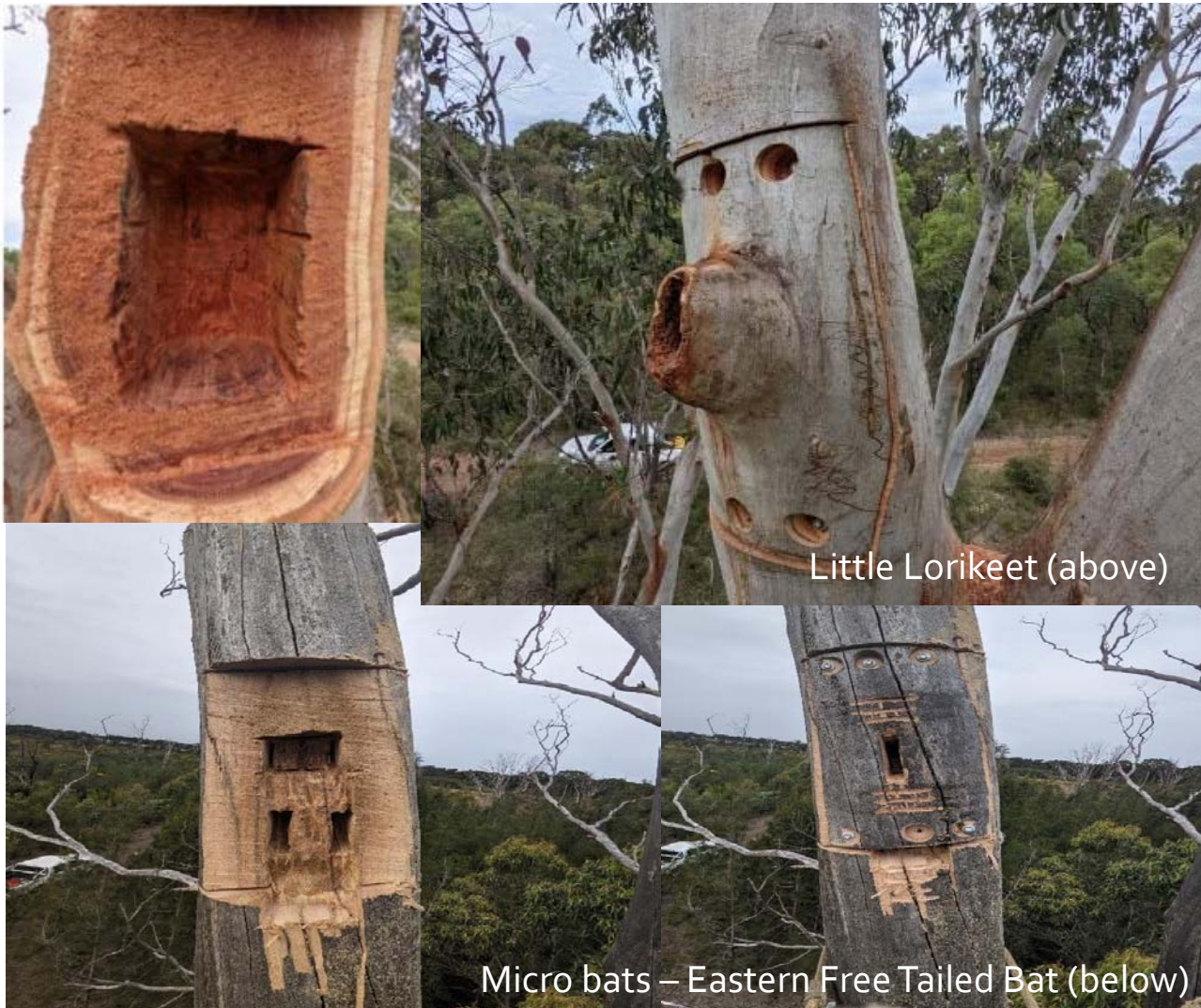
Little Lorikeet (above)