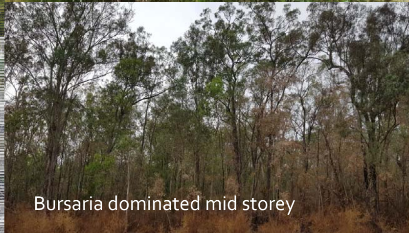
Bursaria dominated mid storey