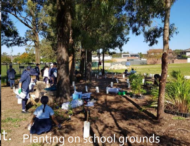
Planting on school grounds