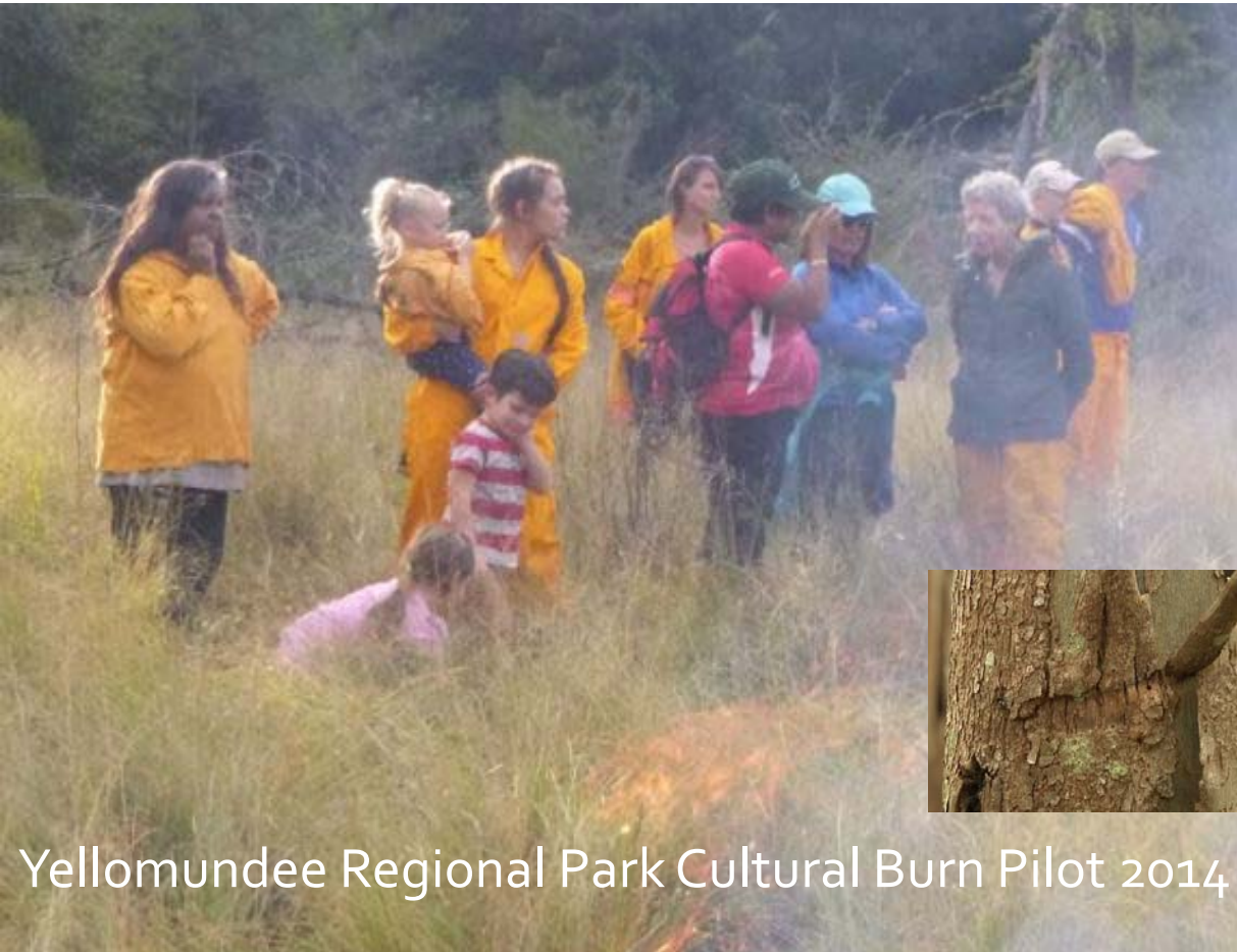
Yellomundee Regional Park Cultural Burn Pilot 2014