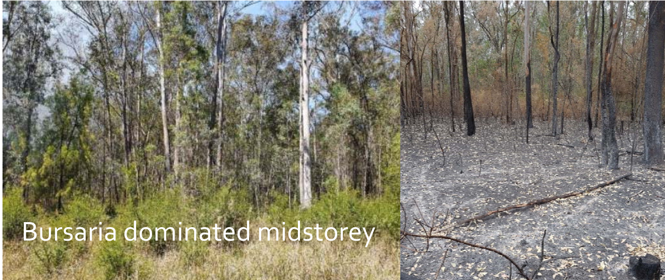
Bursaria dominated midstorey