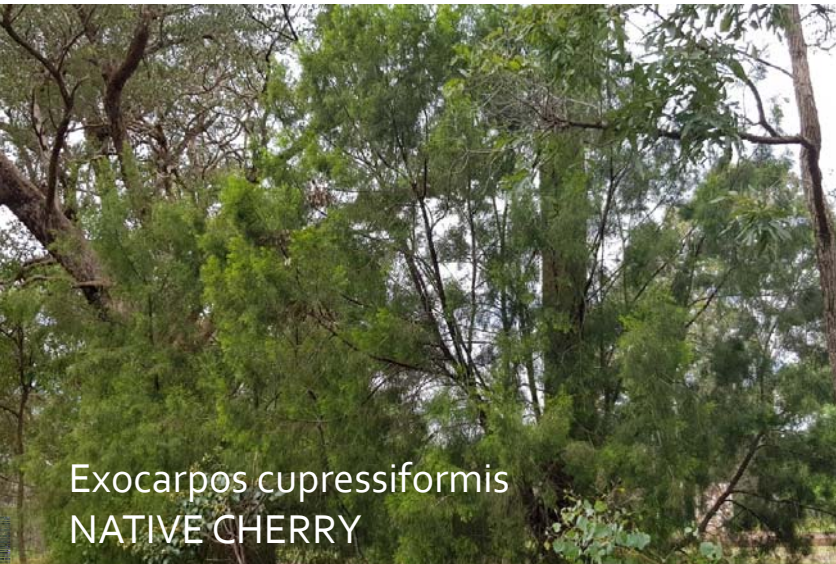
Exocarpos cupressiformis NATIVE CHERRY