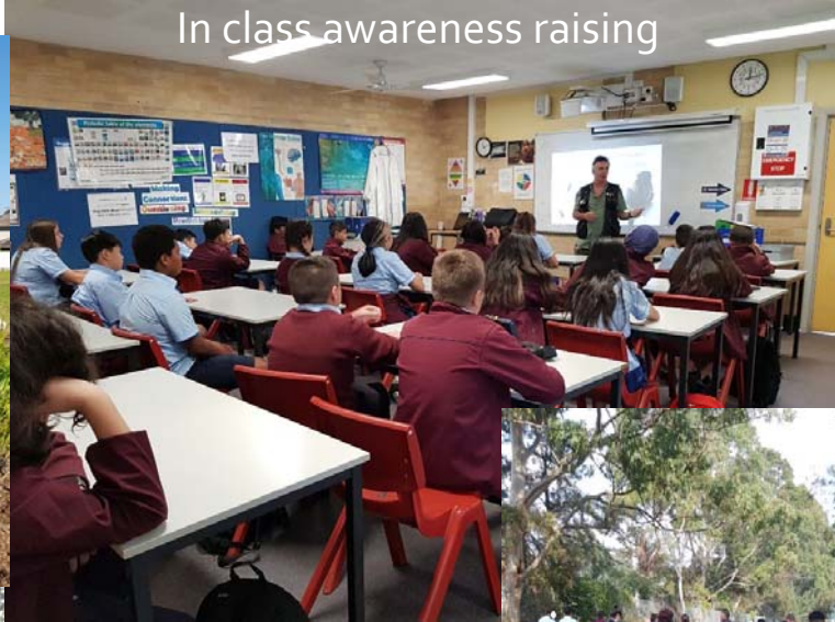
In class awareness raising