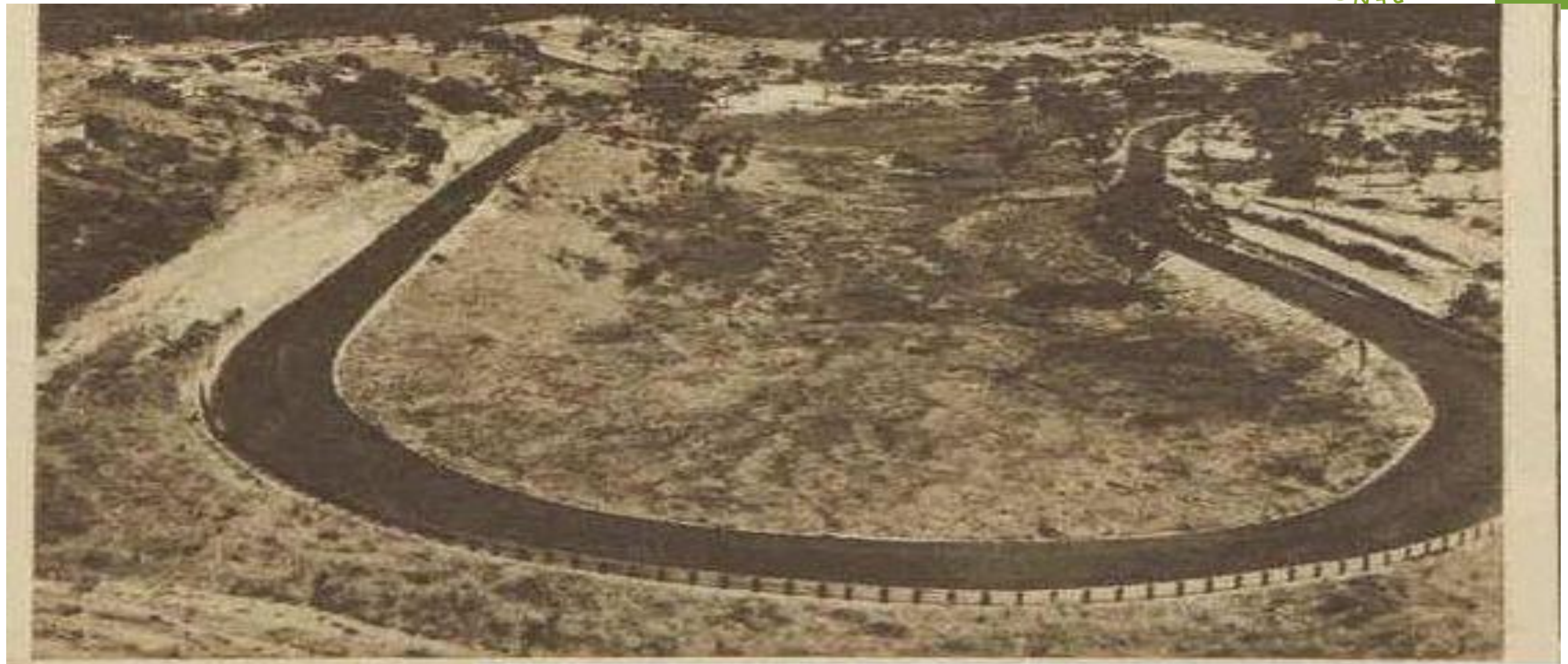
CATALINA Racing Circuit in the Frank Walford Park, Katoomba. Local residents helped with building the track, with raising money, and actually working on the site. The track was completed and opened last February.

In 1926 the Government decided to bulldoze the landscape.