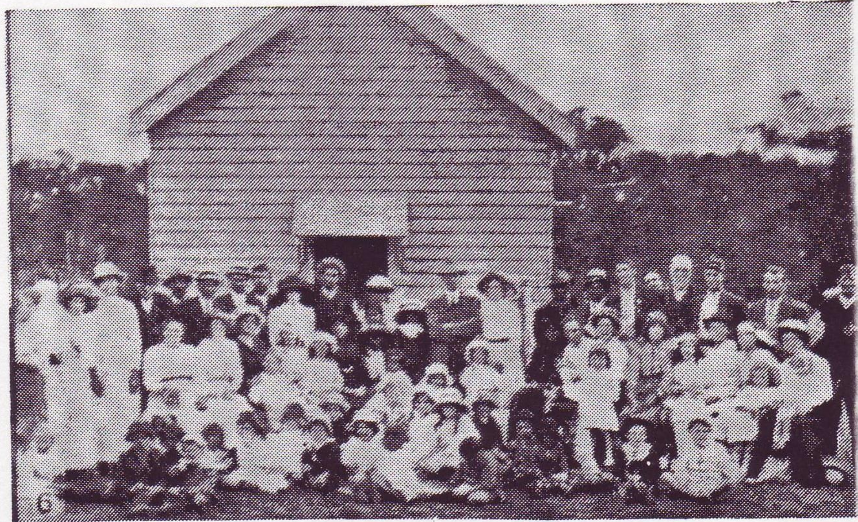
South Katoomba Mission

It was called the Gully as well as South Katoomba Mission.